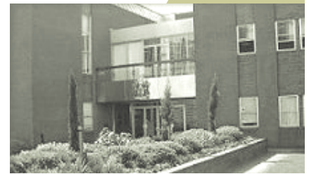
Committee meetings are held at the Civic Offices at six-month intervals. In addition the investment managers report to officers between Committee meetings.

Reports to the Pensions Committee are published on the Council's website.